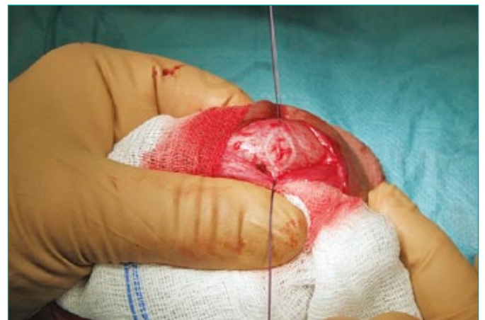
Figure 2. Elliptical incision of external (longitudinal) layer of tunica albuginea on dorsal penile surface.