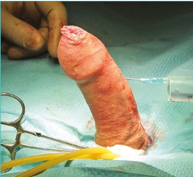
Figure 8. Intraoperative artificial erection: lateral penile curvature (30 degrees, to the left).