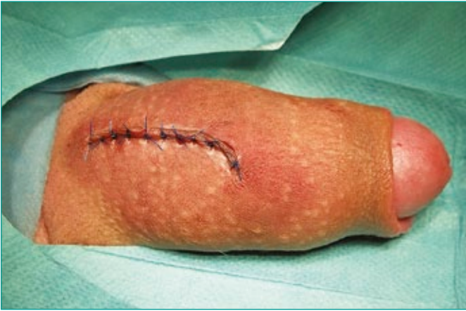
Figure 7. Operative wound is sutured.