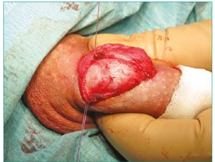
Figure 10. Incised fragment of external layer of the tunica albuginea is excised, internal layer is preserved.

Follow-up examinations were done (with photography of penis in full erection) at 6 and 12 months after the operation. Afterwards, patients were asked to report if any change of penis shape during erection was observed.