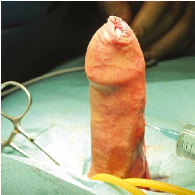
Figure 12. Intraoperative artificial erection: penis is straight.