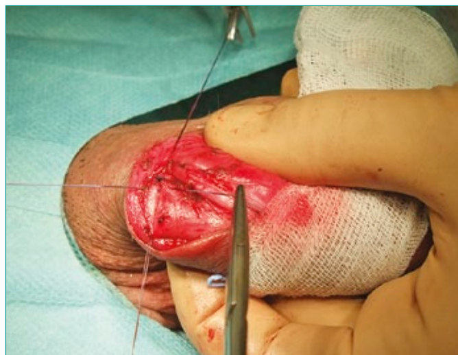
Figure 4. Margins of external layer of the tunica albuginea are sutured over the invaginated internal layer of tunica.

of external layer of tunica is done (Figure 3). Tunica albuginea is then sutured with 3-0 interrupted absorbable sutures passing through its full thickness, approximating the edges of external and invaginating internal layer (Figure 4). In all patients, straightening of the penis is checked by artificial erection. If curvature is still present, more incisions, excisions and plications are made (Figure 5) until curvature is corrected (Figure 6). Sutures placed on tunica albuginea are covered by deep and superficial fascias and by the skin (Figure 7). In patients with dorsal curvature, excisions were done on the ventral penile surface, symmetrically on both sides of the urethra. In lateral penile curvature, the same prin-