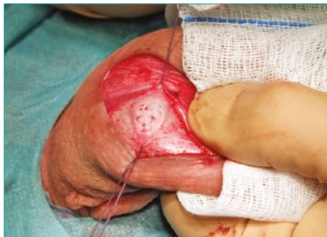
Figure 3. Incised fragment of external layer of tunica albuginea is excised, internal (transversal) layer is preserved. Above upper stay suture right NVB (medially moved) is seen. Clear colour difference between internal and external tunical layers is seen.

index finger against the concave surface of the penis while his/her thumb is pressing the convex penile side. In ventral curvatures, dorsal NVBs are minimally mobilized longitudinally and elevated bilaterally together with Buck's fascia to the lateral margin of the deep dorsal vein groove. Elliptical incision of external (longitudinal) layer of tunica albuginea is done carefully between stay sutures (Figure 2), with preservation of the internal (transversal) layer. It is important to press delicately on the tunica with the knife during incision, which diminishes the possibility of tunical perforation into the corporal cavity. When the incision reaches the level of internal layer of tunica, excision of incised elliptical fragment