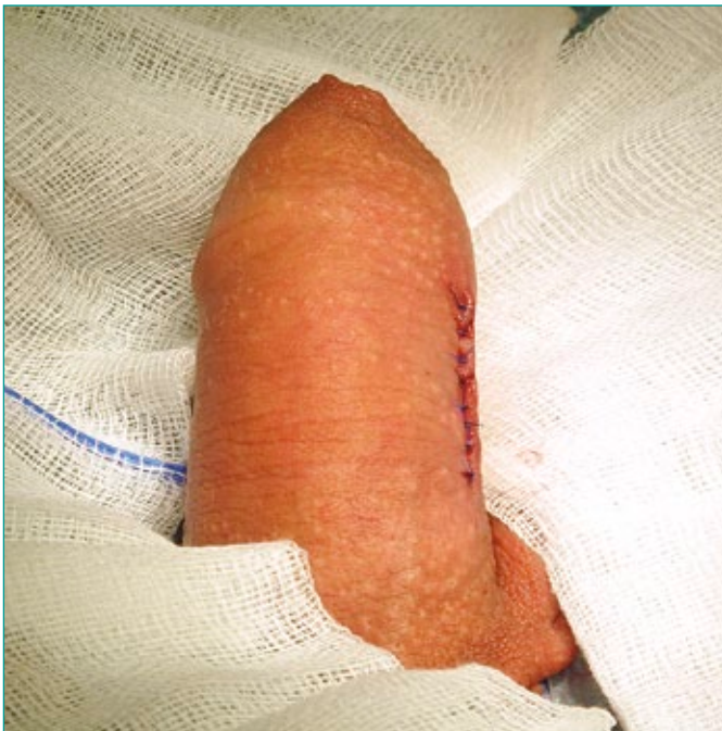
Figure 13. Operative wound is sutured.