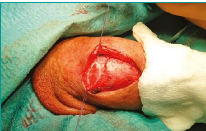
Figure 9. Elliptic incision of external layer of tunica albuginea on right lateral penile surface.

ciple was applied on the contralateral, convex side (Figure 8–13). In all patients, the penis was completely straightened during surgery. Urethral catheter was placed for one day. During the early postoperative period, transient penile oedema, usually mild, was detected. Patients were discharged 2 or 3 days after surgery. Antiandrogens (cyproterone) were given orally 3 days before and 21 days after surgery in order to prevent erections.